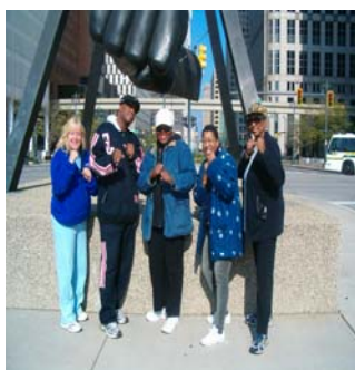
In Huntington Woods