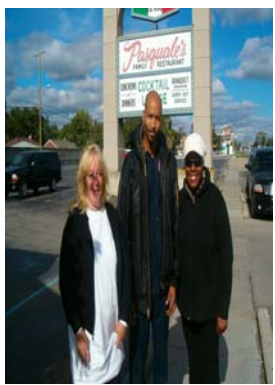
With a friend in Royal Oak